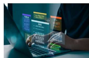
IT, Electronics Sector